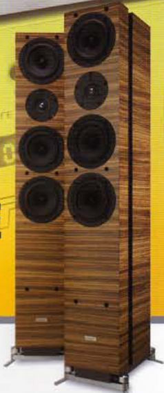
GAMUT PHI5 Five-star looks and sound