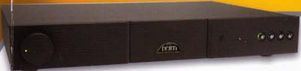
NAIM NAIT 5i An all-rounder at last